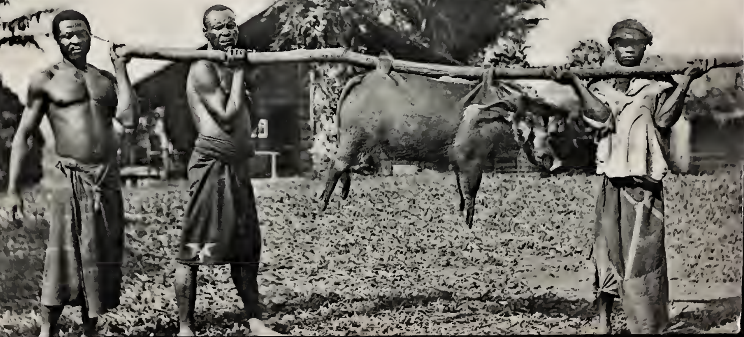
A Wild Hog - Kamerun, West Africa.